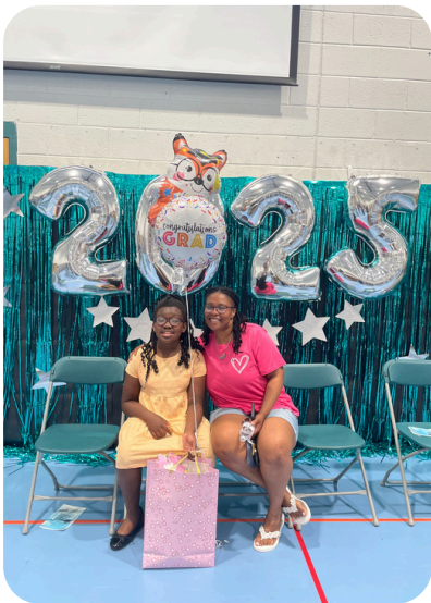
A special moving-up ceremony for one of Coopers Crossing youth transitioning from elementary to middle school.