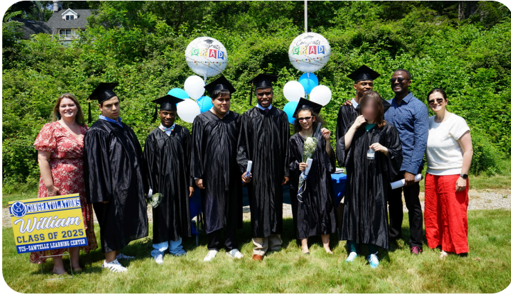
Sawtelle Learning Center