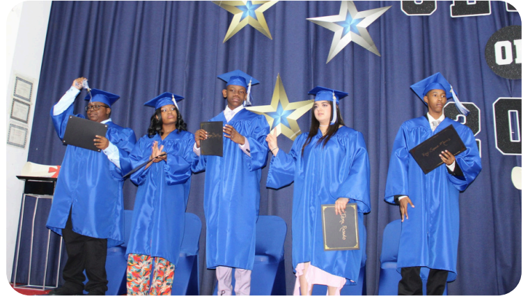
George Washington School